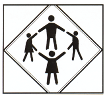
Human Services Collaborative Body Livingston County, Michigan

Additional community resources including food, clothing, housing, and others can be found on the Human Services Collaborative Body website under Local Resources. https://milivcounty.gov/hscb/