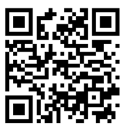
Scan for Resources

We are honored to partner with our amazing community to help empower Livingston County residents with the information they need to improve their overall physical health, mental health and well-being.